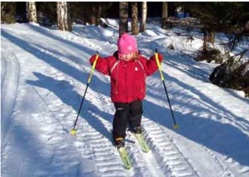
Even little children can ski...

There are a lot of different sport events in Finland. Winter sport is common in Nordic countries.