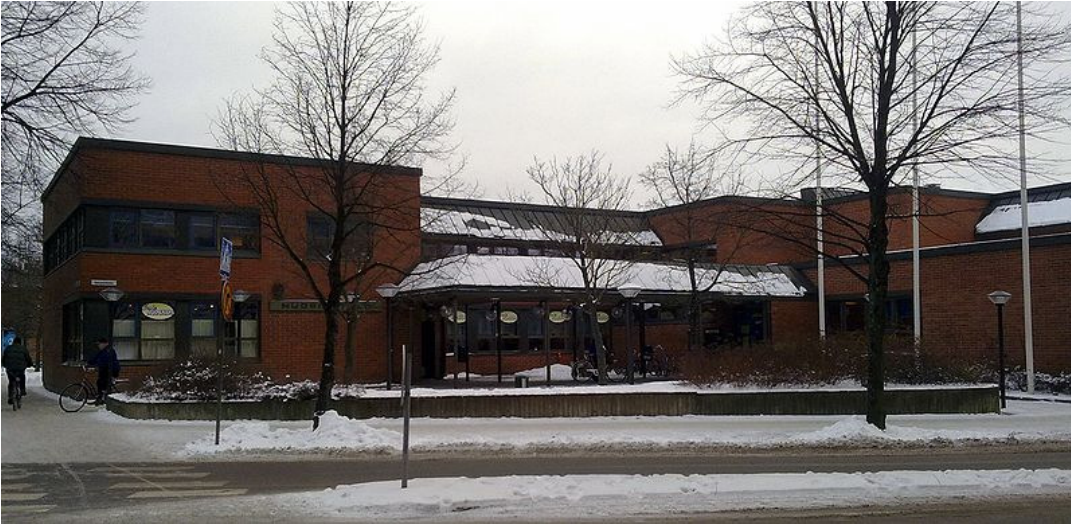
Youth club in city of Pori

Youth club is a place, where the young people spend their time. Young people can meet their friends and play games together. Some Youth clubs have focused different themes like music or art. Youth clubs are usually owned by the city. When the club is open, there is always some youth leader who watch that no-one hurts themselves. Leader is usually adult. Youth clubs are open weekends, but some are open in the middle of week. People who visit in clubs are 13-18 age old.