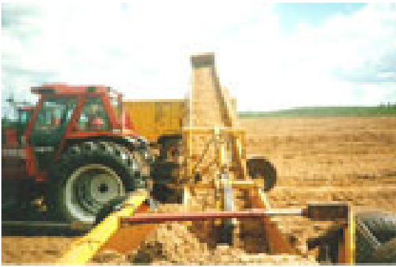
This is a typical view in Merijärvi.