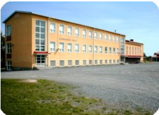
This is our school called Koivupuhto.

There are classes 0–9 in Koivupuhto School. There is also a preschool here. We have about 200 students; in primary school there are about 150 students and in secondary school about 60 students. We have 20 teachers. We study English, Swedish, mother tongue; Finnish, maths, biology, geography, physics, chemistry, household, sports, crafts, arts and crafts, civics, religion, word processing and agriculture and forestry. We have 30 hours a week. Free school lunch is served in our school every day. During our school year we have an autumn holiday (one week), a Christmas holiday (two weeks), a winter holiday (one week), Easter holiday (four days) and a summer holiday (two months).