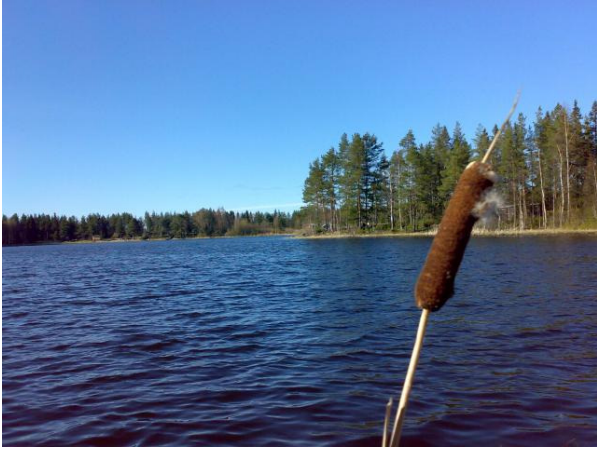
This is the pond Lahdenlampi.