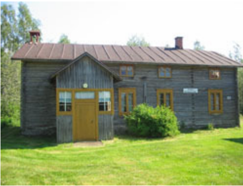
This is the Local history museum Tähjä, where you can see how people lived in the old days.