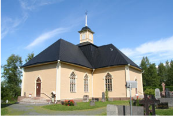
This is the Lutheran Church of Merijärvi. The church was built 1781.