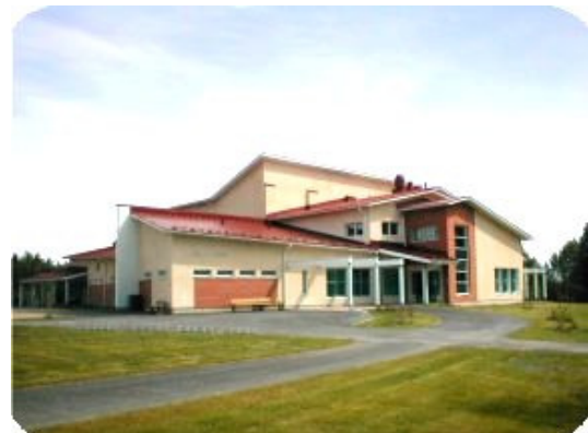
This is the sports hall of Merijärvi, Kilpukka. You can do sports and organize parties here.