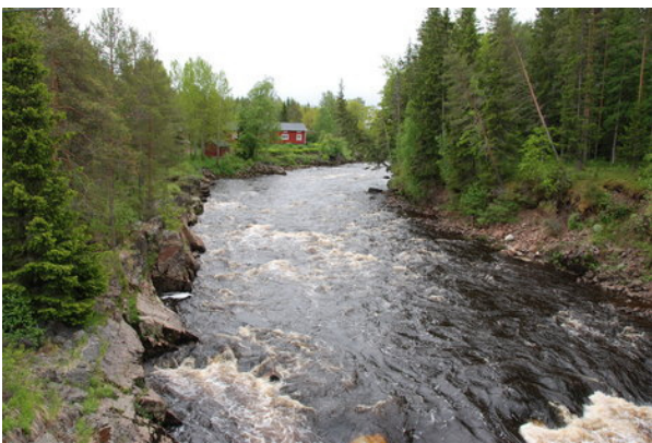
This is the falls of Pyhäkoski.