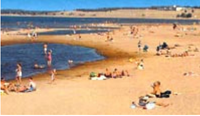
Kalajoki is famous for its sand.

Many people go shopping in Oulainen and Ylivieska